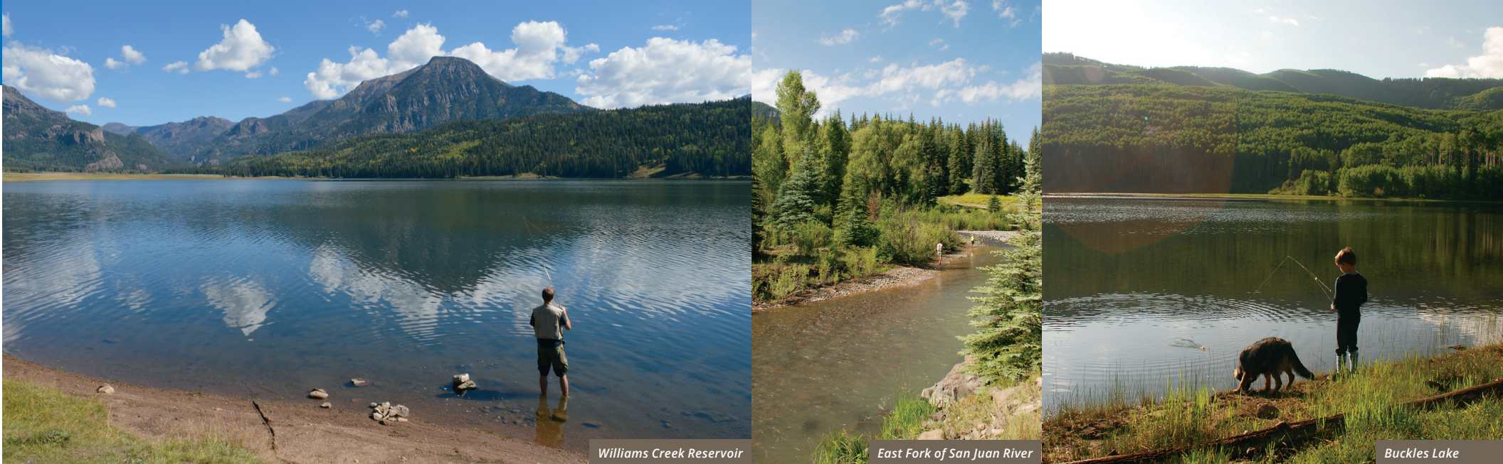
Williams Creek Reservoir