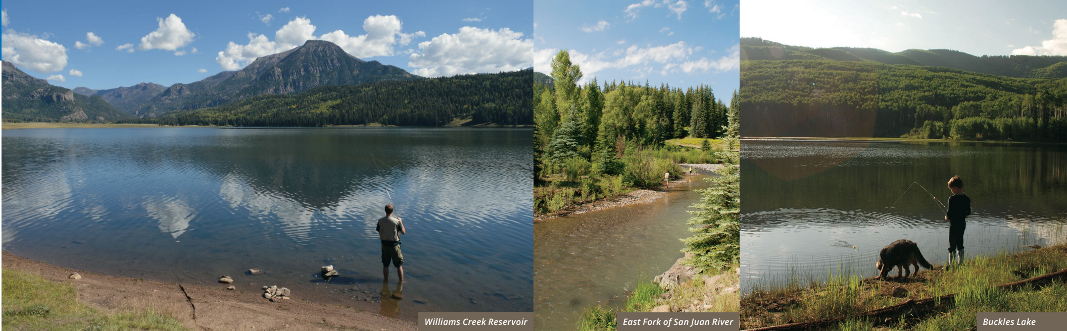
Williams Creek Reservoir